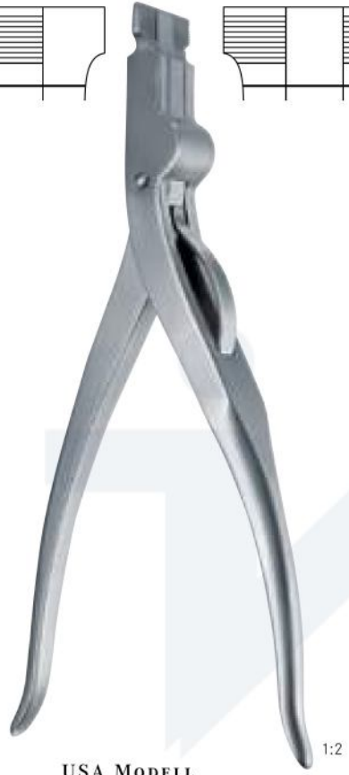
USA MODELL 230 mm - 9" | DP-786-13-10