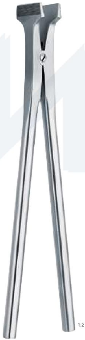
BEESON 300 mm - 12" | DP-786-13-11