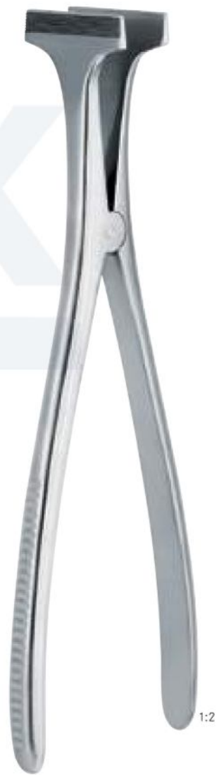
HENNIG 280 mm - 11" | DP-786-13-12