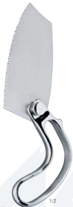
BERGMANN 1:2 180 mm - 7" DP786-13-02