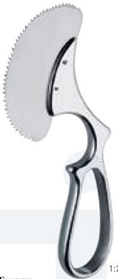
ENGEL 1:2 140 mm - 5½" DP786-13-01